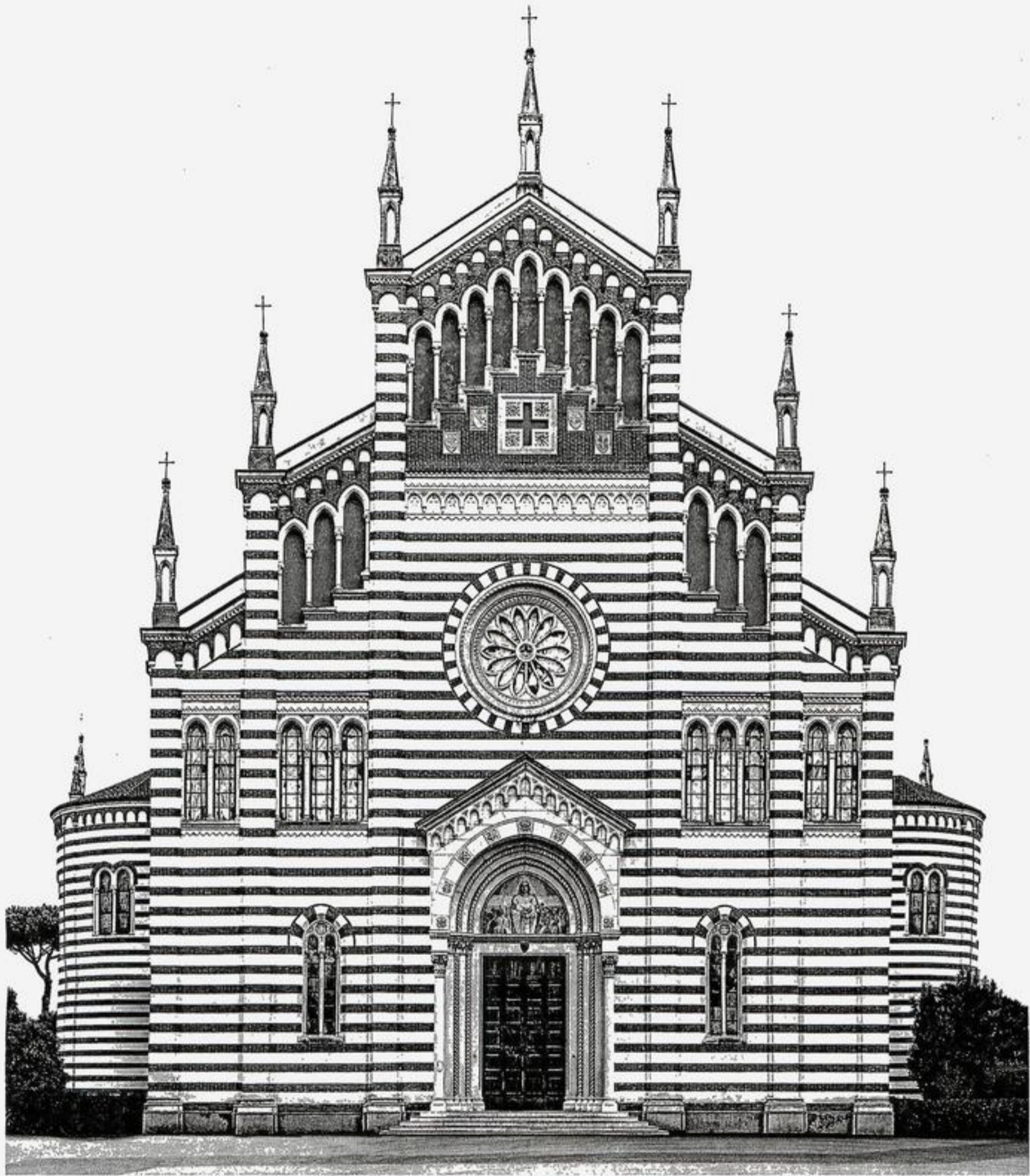
Far left: Cologne Cathedral, in Cologne, Germany.