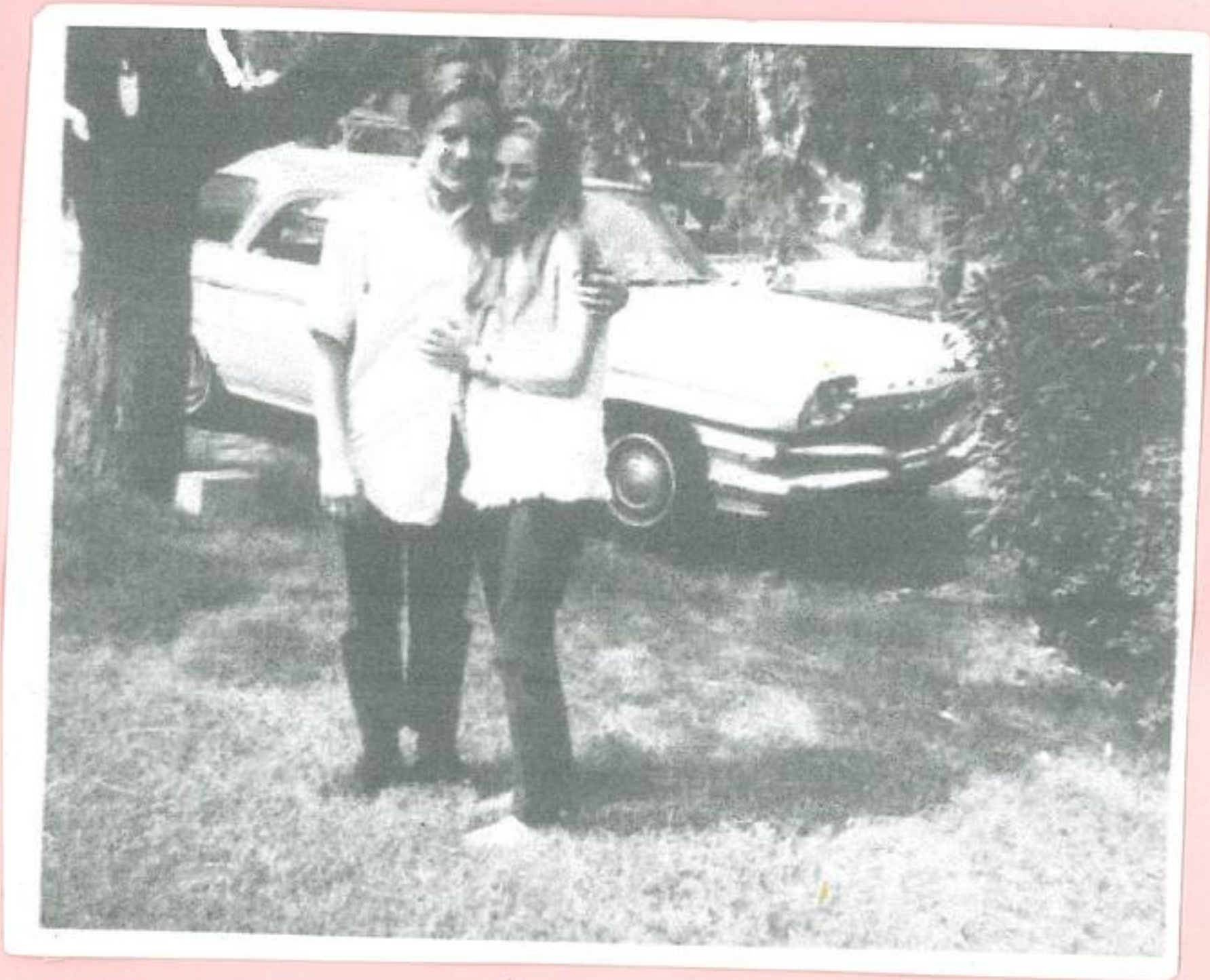
(Above) My Mom & Dad — 1967.