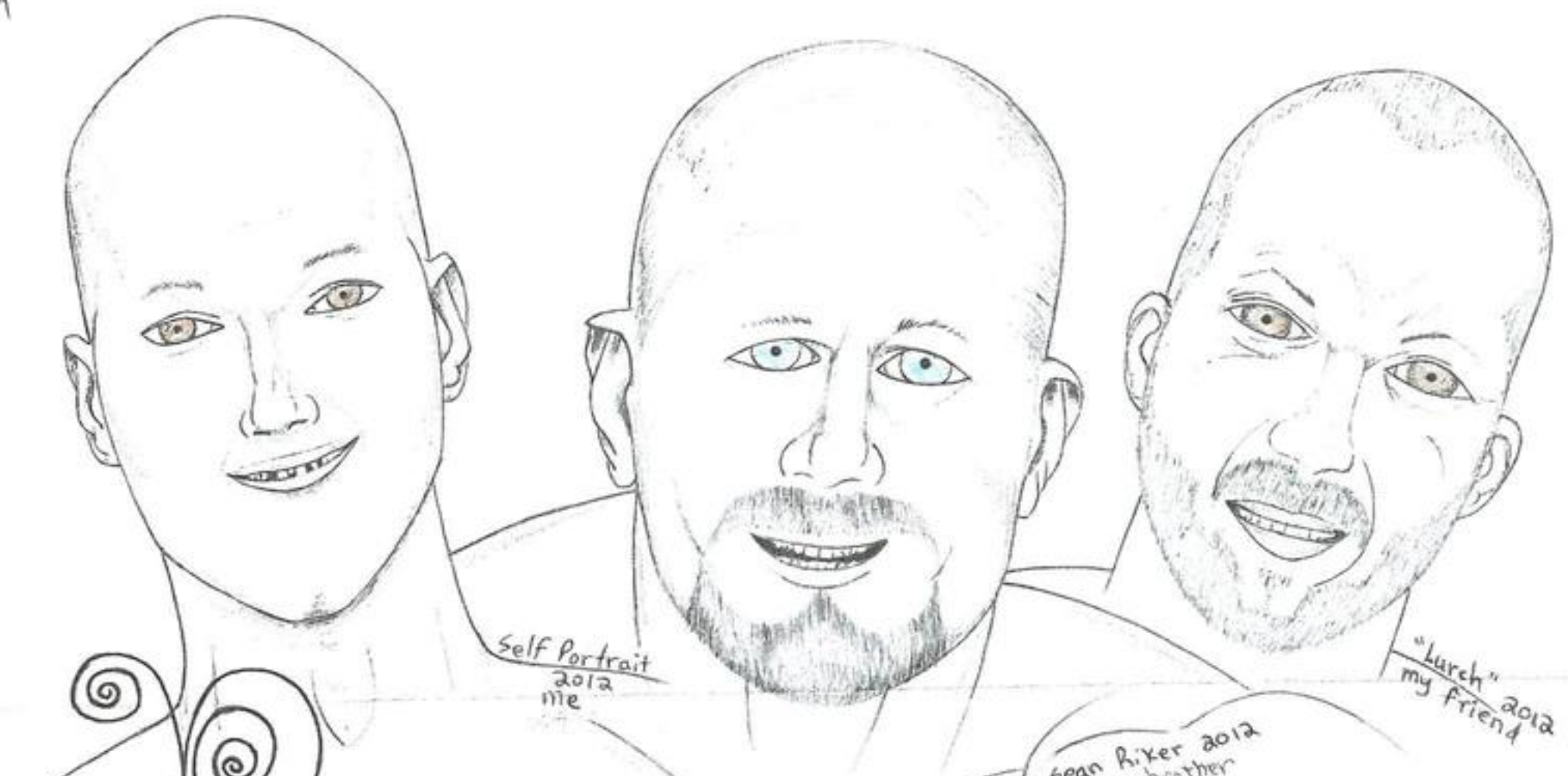
Self Portrait 2012 me