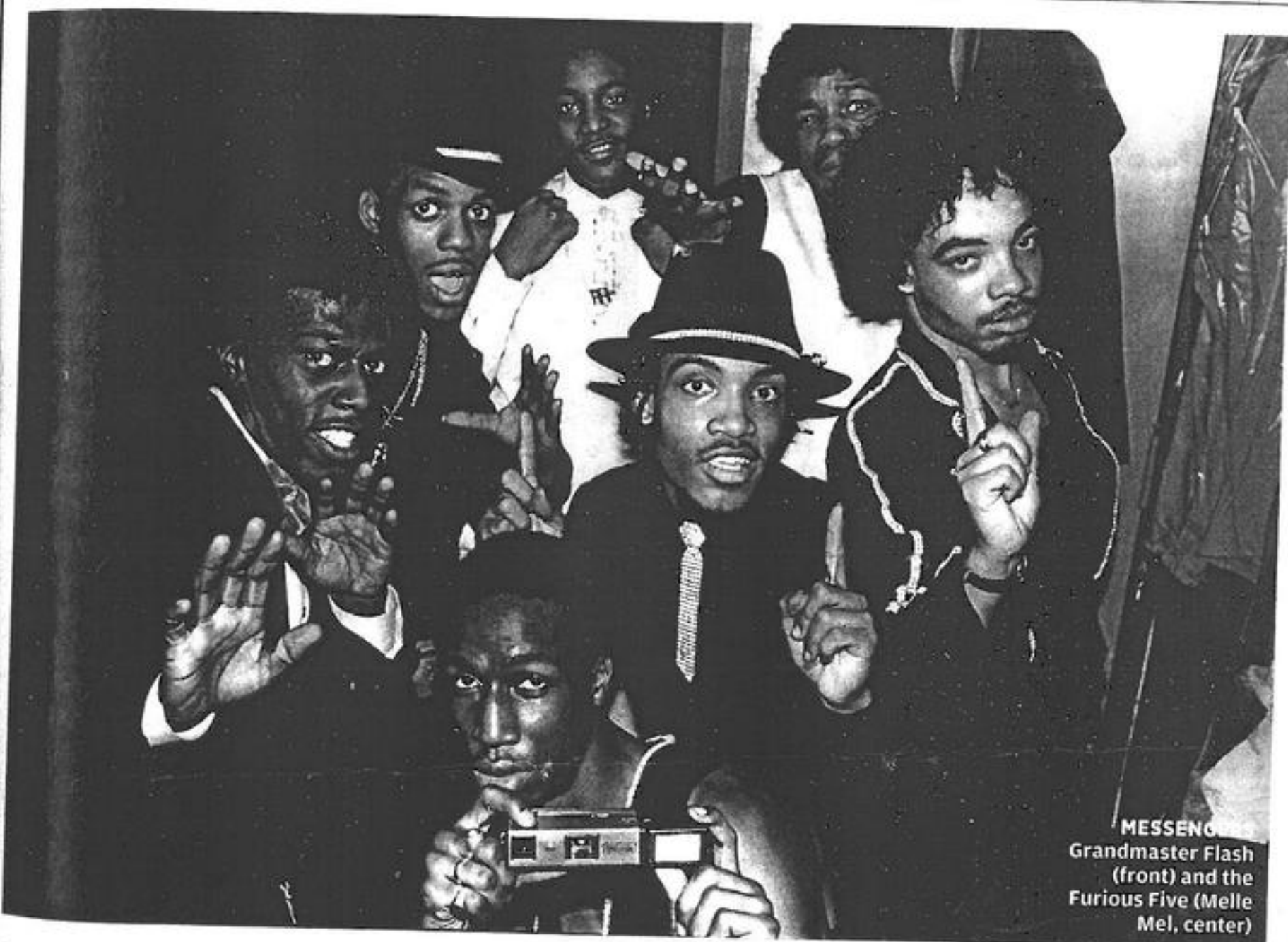
MESSAGE Grandmaster Flash (front) and the Furious Five (Melle Mel, center)