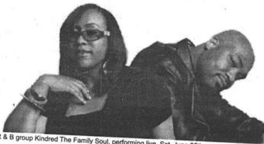
R & B group Kindred The Family Soul, performing live, Sat. June 25th.