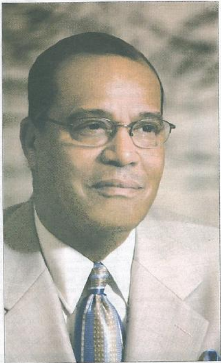
The Honorable Minister Louis Farrakhan