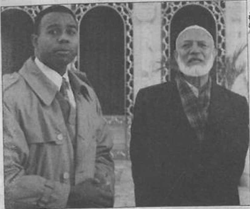
Brother Wali with Islamic Scholar Ahmad Deedat in Mosque Maryam in Chicago.