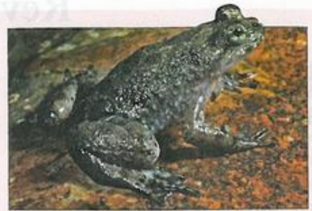
To be born again: A gastric-brooding frog

served in Siberian permafrost, though that might still take decades. So far the goat-like Pyrenean ibex is the only extinct species scientists have revived, using cells recovered from the last survivor to clone an offspring that lived for only 10 minutes after its birth, in 2003. Since then, advances in cloning technology have made it possible to bring back any species for which we have even a scrap of DNA—so, not fossilized dinosaurs, but perhaps Neanderthals. Many argue that priority should go to conserving living species: habitat loss, hunting, and climate change could cause the extinc-