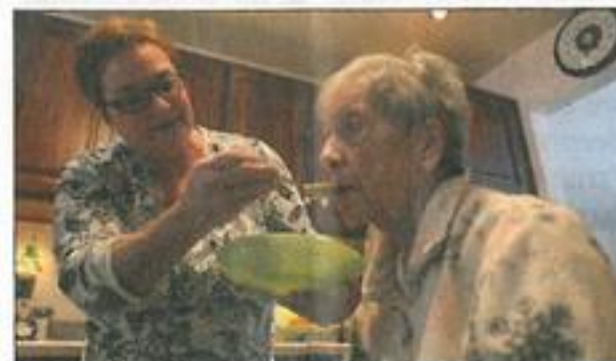
Alzheimer's: An ever-more-common fate