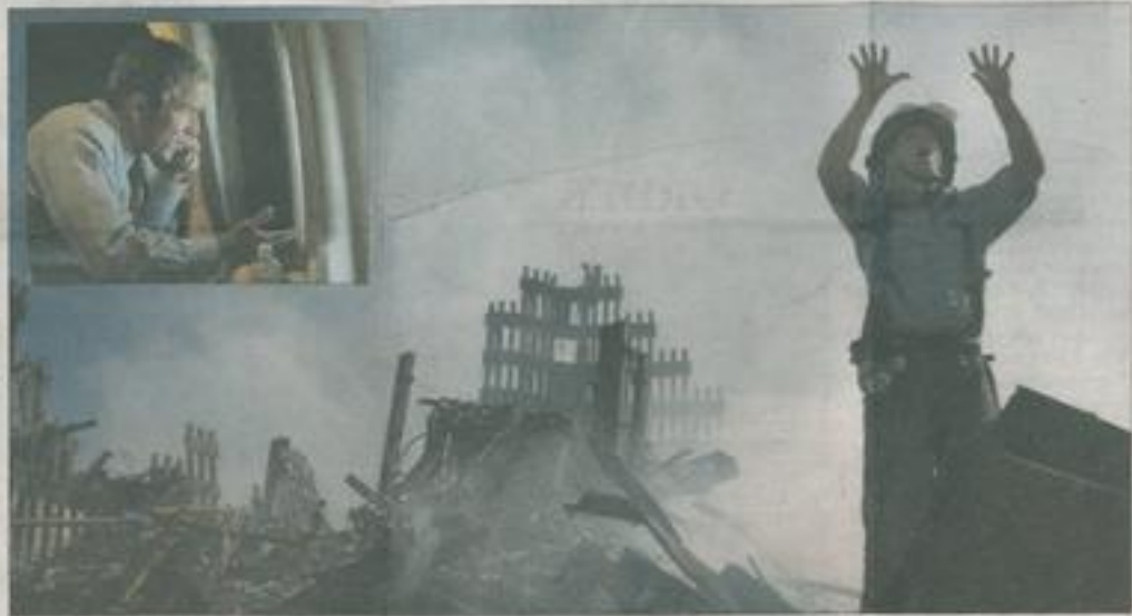
A New York City fireman calls for 10 miles rescue workers to make their way into the rubble of the World Trade Center. (inset) President George W. Bush on Air Force One after attacks on American soil September 11, 2001.

Richard Perle, chairman of the president's Defense Policy Board Advisory Committee wanted to focus on taking this country to war with Iraq; then National Security Advisor Condoleezza Rice—an authority on Russia—wanted the U.S. to reinstate the U.S. ballistic missile system,