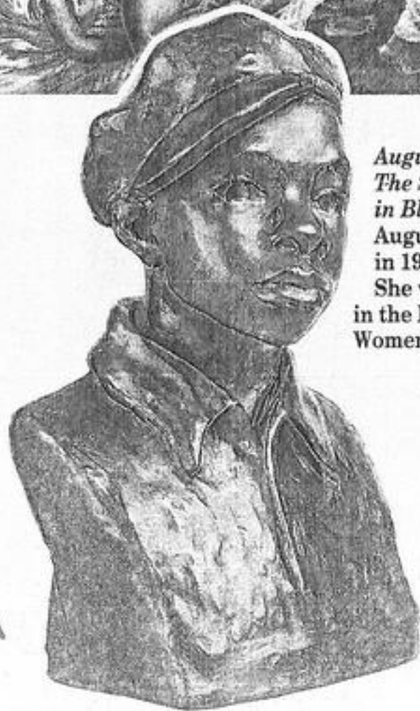
Augusta Savage, Gamin The Schomburg Center for Research in Black Culture, New York Augusta Savage sculpted this piece in 1930, using plaster as her medium. She was the first African American in the National Association of Women Painters and Sculptors.