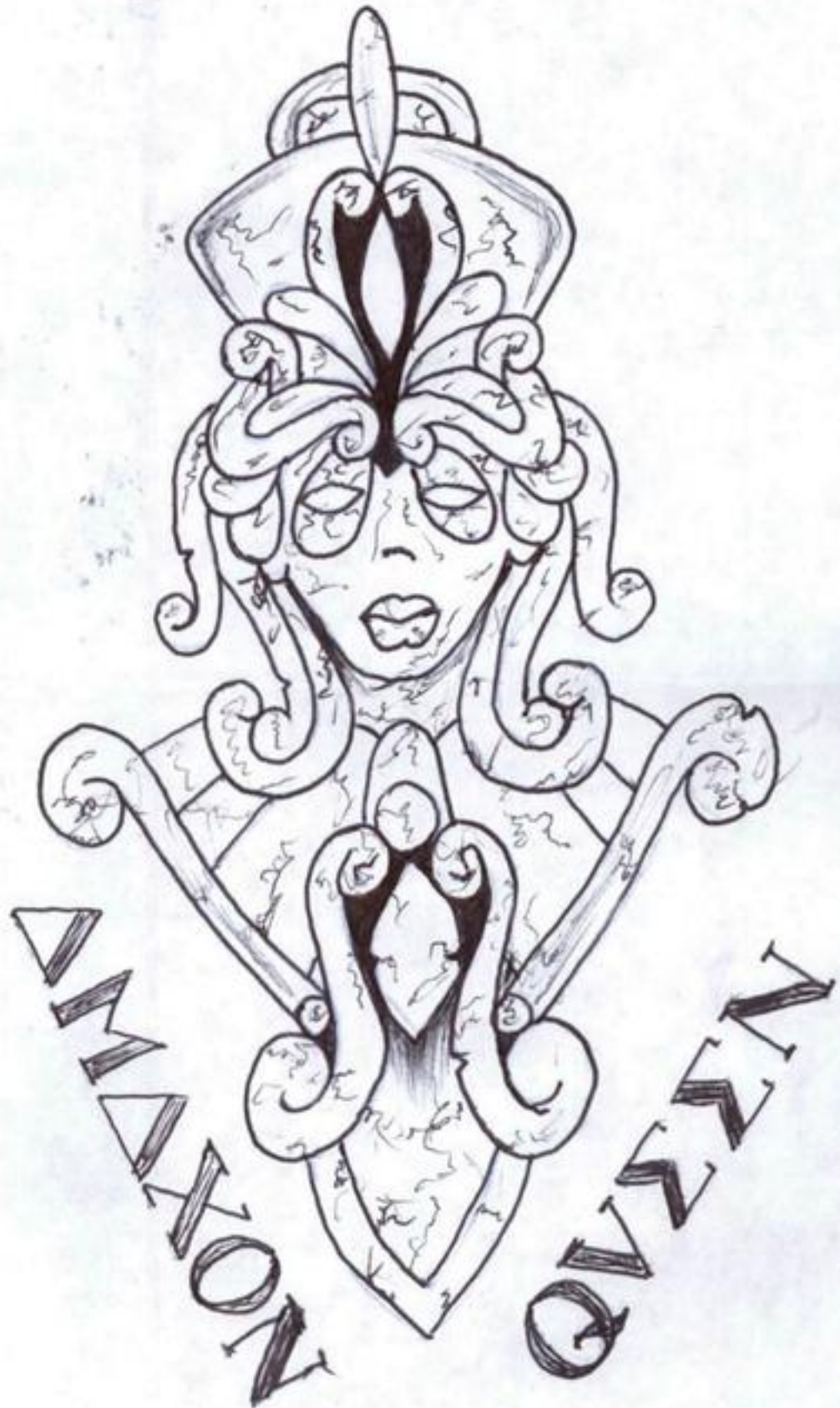
L. upper arm