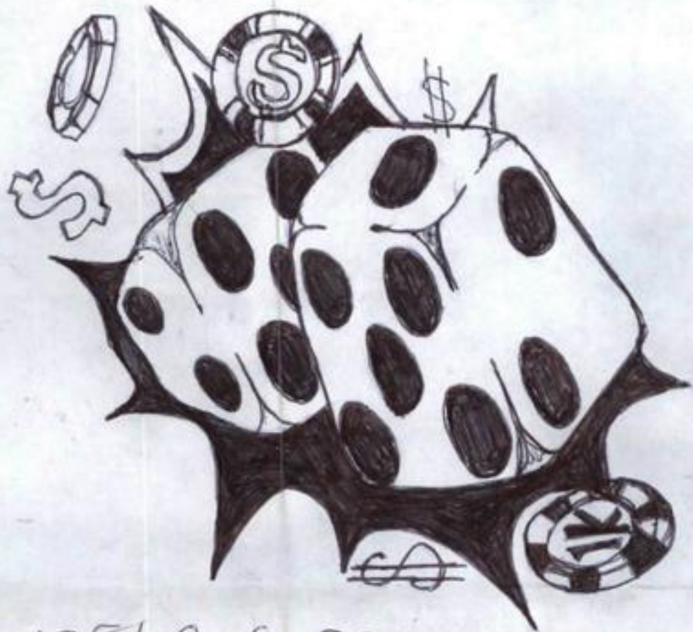
Left Crotch of arm.