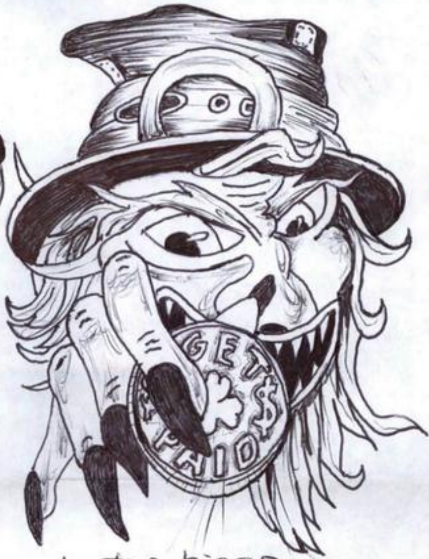
L. top bicep