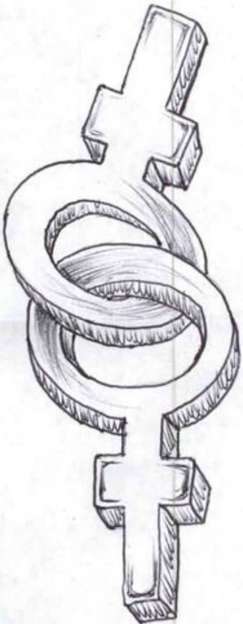
L. inside elbow