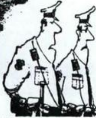
"SOME PEOPLE JUST CANT STAY OUT OF TROUBLE, CAN THEY?"

We modified our charging policies so that certain low-level, nonviolent drug defendants, with no significant ties to large-scale organizations, gangs, or cartels, will no longer be charged with offenses triggering mandatory minimum sentences. Instead, they will be charged with offenses that allow prosecutors and defense counsel to argue for, and judges to impose, sentences better suited to their conduct. Under our new policy, those enhancements are to be used only in those cases warranting the most severe sanctions. By making these changes to our policies, we intend to make smarter use of our limited and costly prison space and reserve the longer sentences for the most serious, high-level or violent drug offenders. And embedded in this issue of fairness is the consideration of sentence reductions for those who, at an earlier time, encountered severe and inflexible sentencing laws.