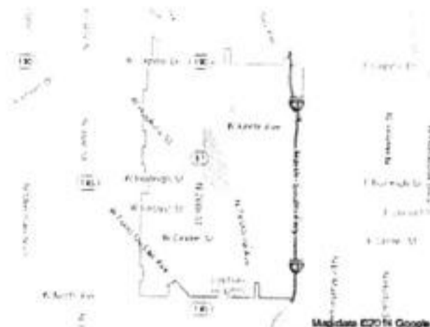
( http://mediad.publicbroadcasting.net/p/wuwm/files/201402/53206-map.png )

So what you find today in 53206 are programs to connect with residents, so they can share the burdens they carry.