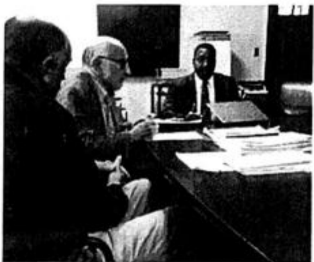
( http://mediad.publicbroadcasting.net/p/wuwm/files/201402/Photo3.jpg )