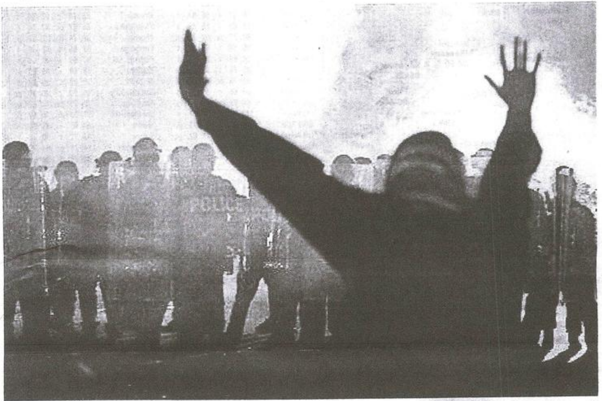
A protester faces Baltimore police enforcing a curfew placed in April after the killing of a black man by police led to rioting. The writer suggests racism will lead to a violent response from oppressed minorities.