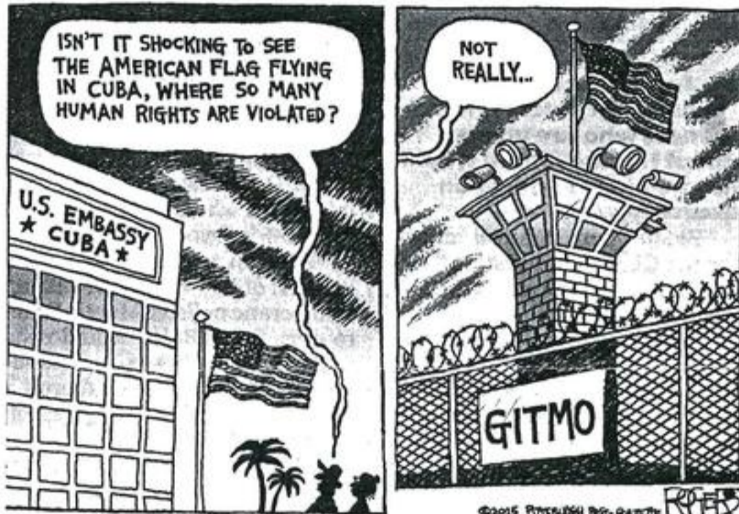
ROB ROGERS, PITTSBURGH POST-GAZETTE, UNITED FEATURE SYNDICATE