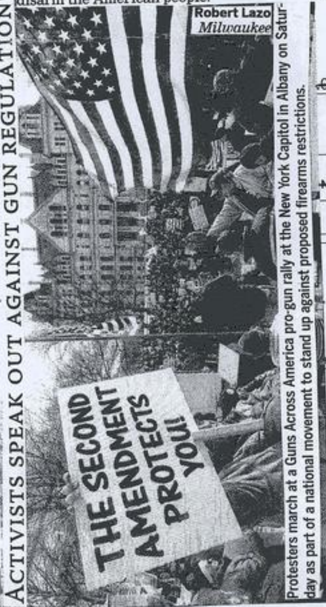
Protesters march at a Guns Across America pro-gun rally at the New York Capitol in Albany on Saturday as part of a national movement to stand up against proposed firearms restrictions.

Thus, any attempt to ban their possession, sale, purchase or transfer is an attempt to disarm the American people.