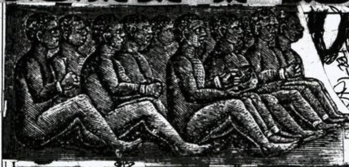
Cramped quarters for slaves decks on the Amistad.