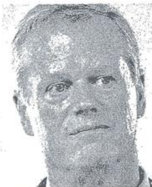
GOV. CHARLIE BAKER