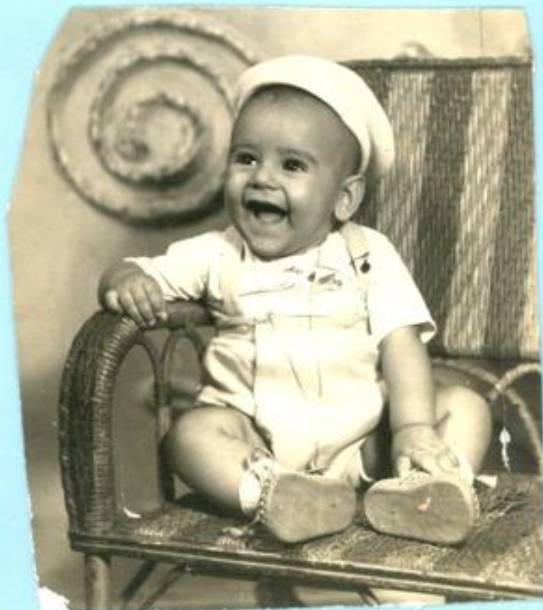
UPPER LEFT: MY FATHER AND 1-YEAR OLD ME. INSET: MY MOTHER AND ME. UPPER RIGHT: ME AT 2 YEAR OLD. BOTTOM LEFT: ME AS A 49 YEAR OLD MAN. BOTTOM CENTER: ME AS A TODDLER. BOTTOM RIGHT: MY MOTHER HOLDING MY DOG CURUNGO.