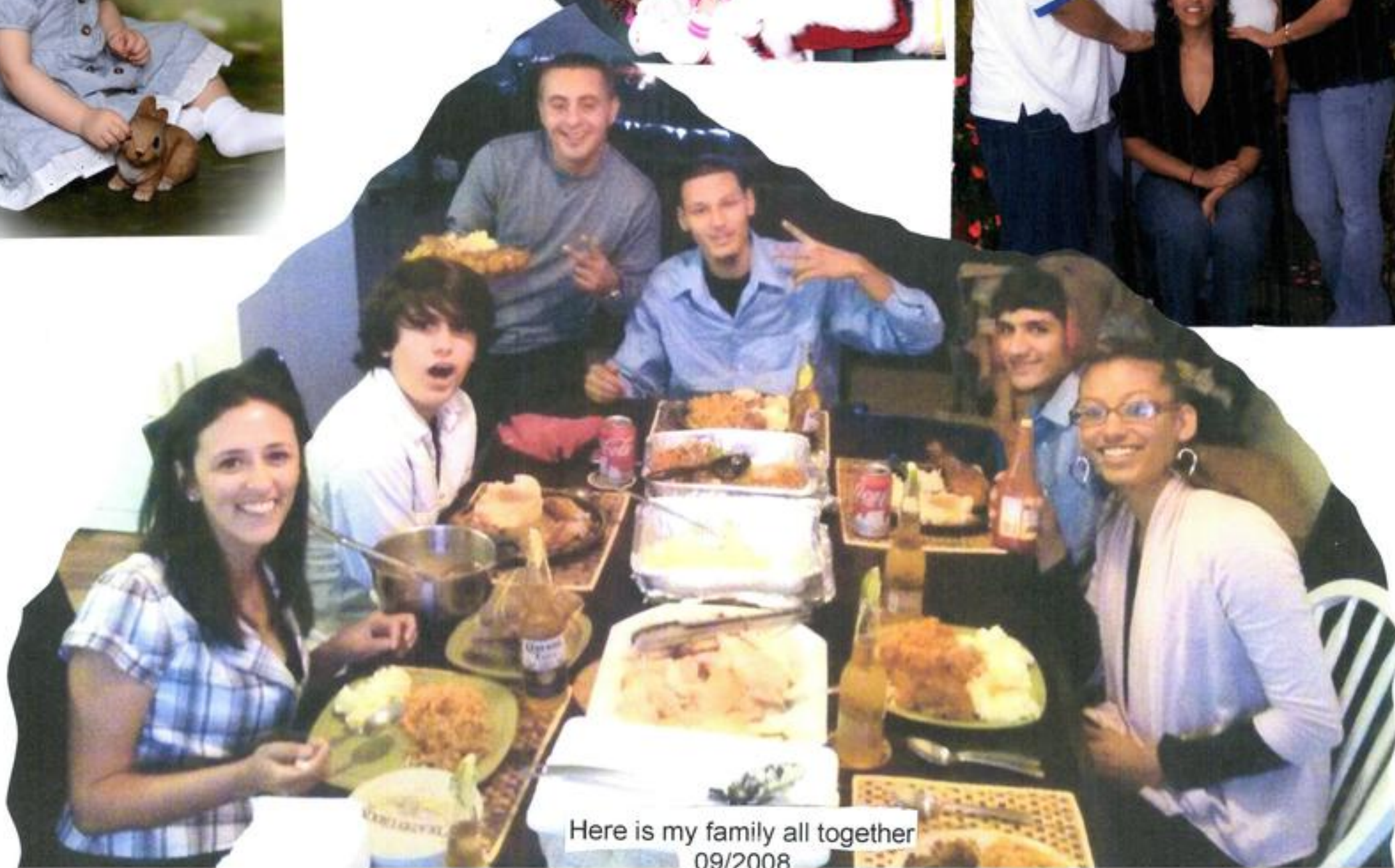
Here is my family all together 09/2008