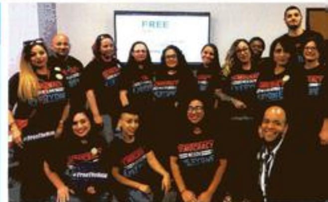
Initiate Justice staff, members, and volunteers in Sacramento advocating for ACA 6 on 4/29/19.

STATUS: Failed. Unfortunately, AB 277 failed to pass the Assembly Appropriations Committee. We are working with the author and co-sponsors to find a way to bring it back up this year, but in the meantime, we no longer need to get letters of support for this bill. We will continue to keep our members posted on its status.