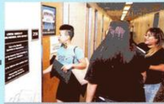
"This program is called 'The Institute of Impacted Leaders', and our participants have been working hard to get our bills passed."

Take the time to let the Legislature know how this bill will impact you. Share about who you are, the positive things you are doing, and what you hope to accomplish. Legislators need to hear from folks inside so they can truly understand the impact that their vote can have.