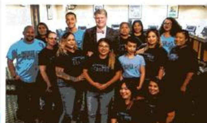
Initiate Justice members & staff meeting with Assemblymember Stone, the author of AB 45 & AB 965.