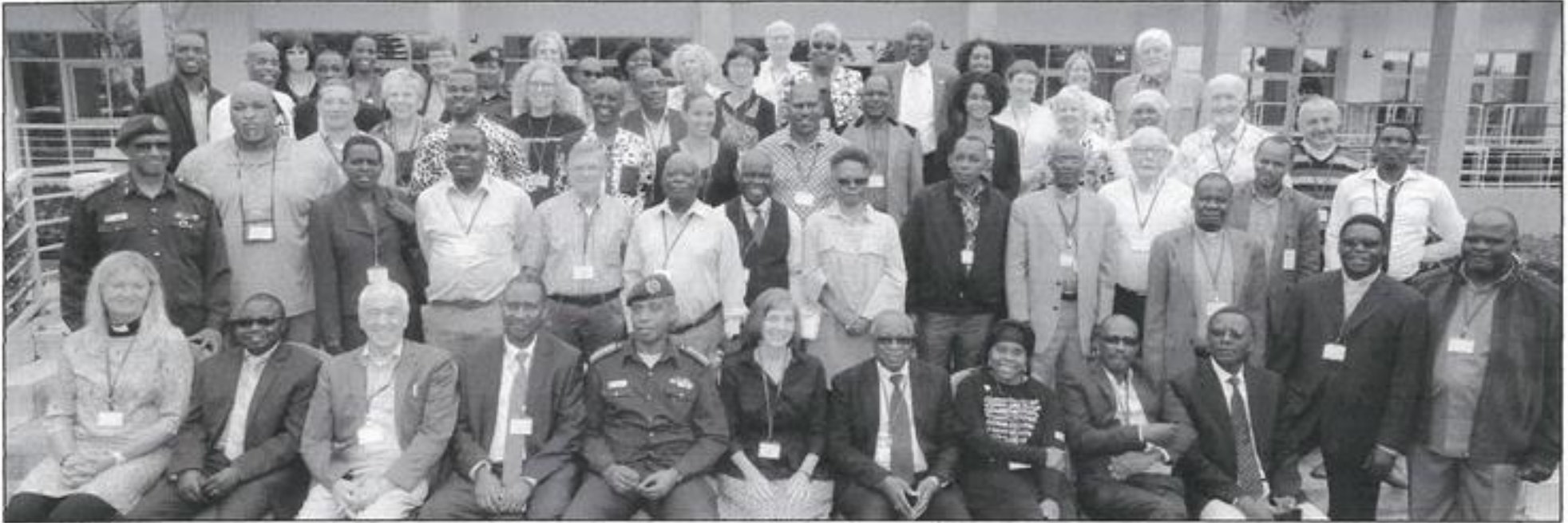
Pictured are most of the 60 people representing 18 countries who participated in CURE's 8 th International Conference on Human Rights and Prison Reform in Kigali, Rwanda, in Africa in 2018.

Email cure@curenational.org for a registration form for CURE's 9 th international convening. This will be at the 14 th United Nations Crime Congress April 21-26, in Kyoto, Japan