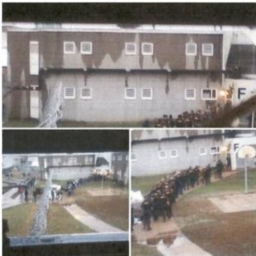
An image shared of the state troopers and correctional officers standing outside Unit 29 at Parchman

THEY TRYING TO KILL US !! THEY GOT GUNS AN THEY SHHOTING FIRST TALK LATER....WE HAVEN'T ATE NO FOOD AT ALL TODAY