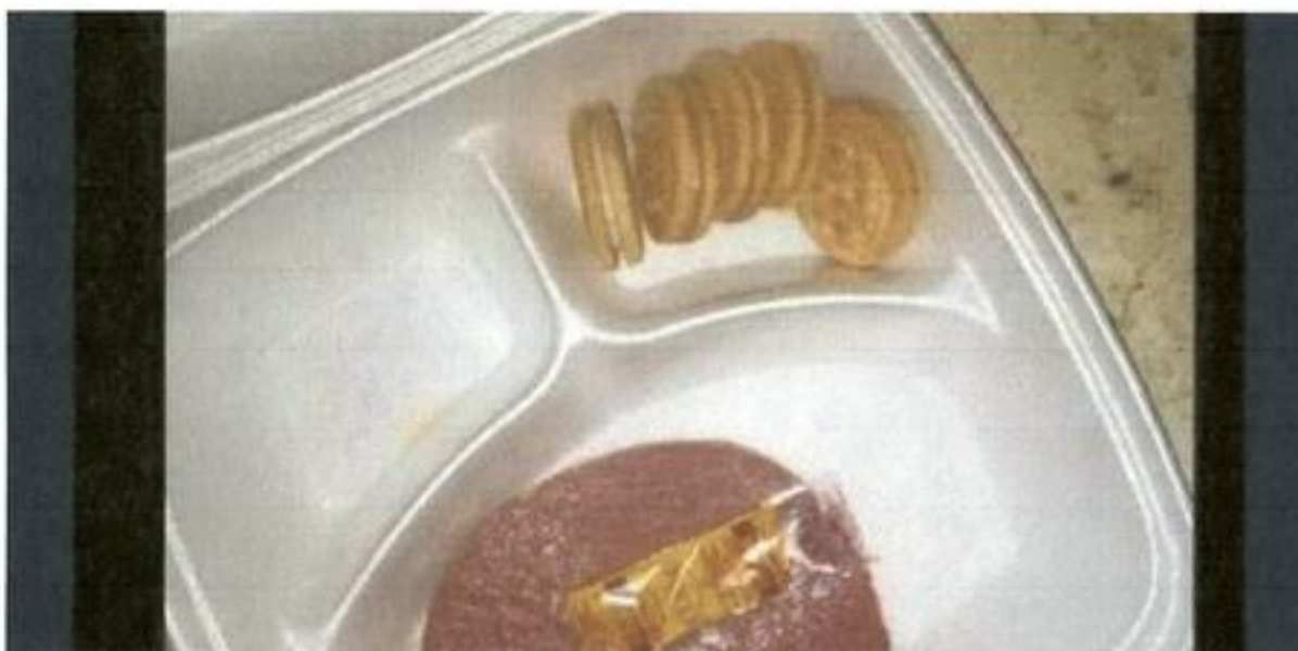
This is what inmates on lockdown at Parchman were served for dinner last night.

That the inmates that were in Unit 29 (where Walter Gates and Unnamed Deceased were being housed) are now moved to Unit 32. Unit 32 is sometimes referred to as a "Death Trap." Unit 32 is a CLOSED UNIT that has not been utilized since 2010. It is the former Death Row Facility and Was Closed Due to Poor Conditions when the ACLU won a Victory to have it shut down due to the deaths of multiple inmates in the facility.