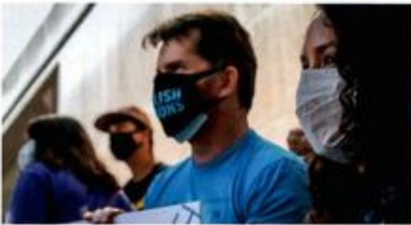
Members of IJ community at rally for Los Angeles DA George Gascon