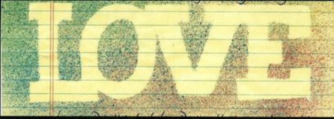
Artwork from our Inside Members located in California City Correctional to show their gratitude to the Initiate Justice team and Outside Members!