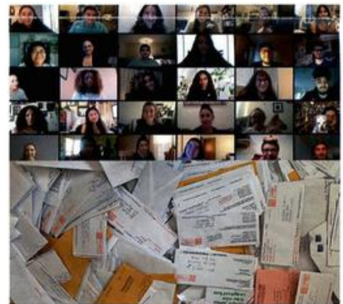
Pictured above is another Mail Night we had, this time with Southwestern Law School's Mass Incarceration Awareness Law Society (MIALS)