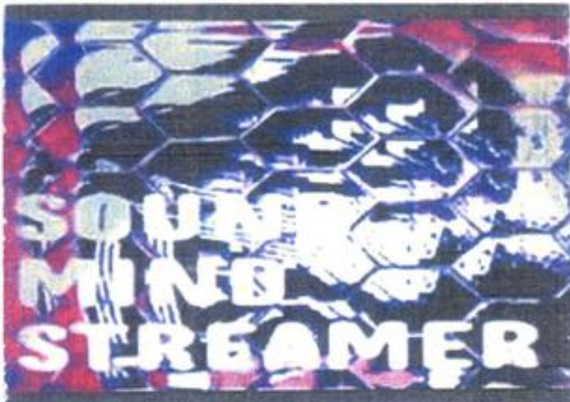
Sound Mind Streamer

The group participants unanimously agreed to present a safe and constructive Banquet, with PRIDE !