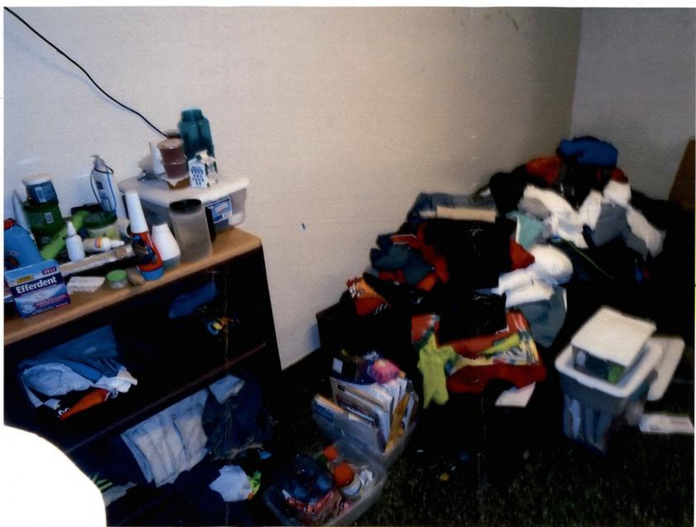
-8- After search