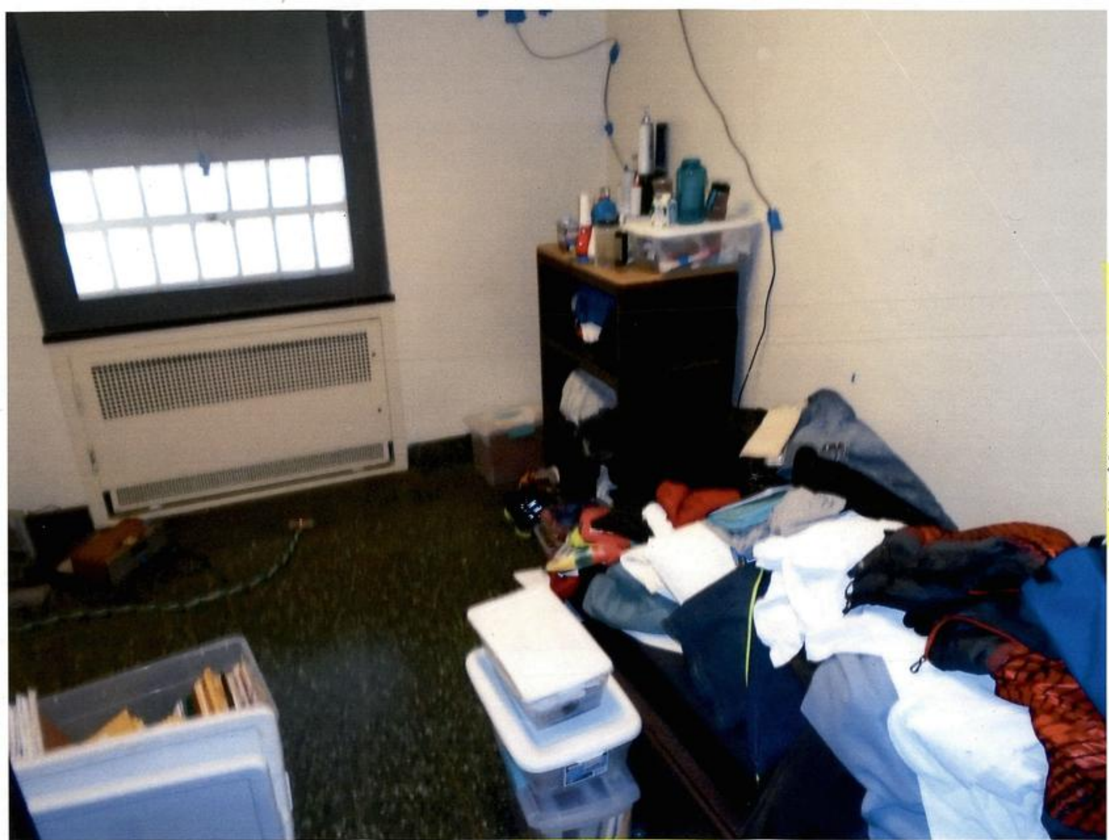
- 5 - After search